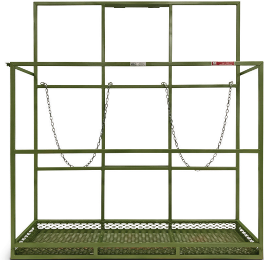
Frame Scaffold Carrier (100-2) 5'4" x 1'6" x 6'