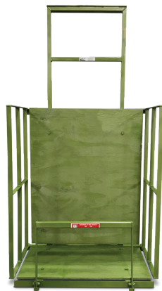
Universal Platform (100-3) 2'6" x 1'5" x 3'