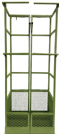
Scaffold Carrier XL (100-5) 2'4" x 1'9.5" x 6'