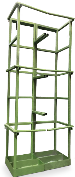
Scaffold Basket (200-3) 1' x 1'1" x 6'