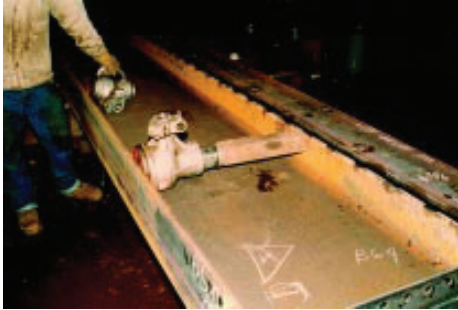
Outdoor use and weld splatter can shorten the life of standard jacks. "We chose Simplex Superjacks for the bullet proof construction and holding power." They provide trouble-free service in the roughest applications. — Simplex® Customer