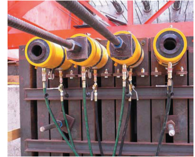
Double-Acting Hollow Plunger