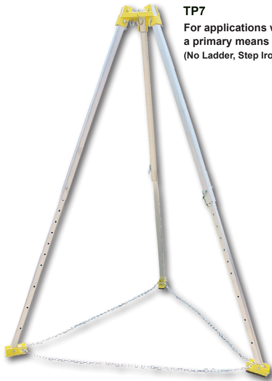
TP7 For applications without a primary means of entry. (No Ladder, Step Iron, etc)